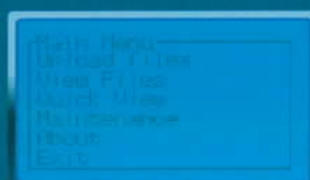
COMPANY CARD MAIN MENU