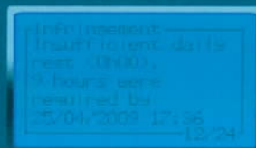
EU RULES ISSUES DISPLAYED