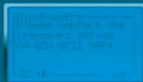
MESSAGES CAN BE LEFT FOR DRIVERS