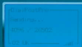
CARD UPLOAD PROGRESS